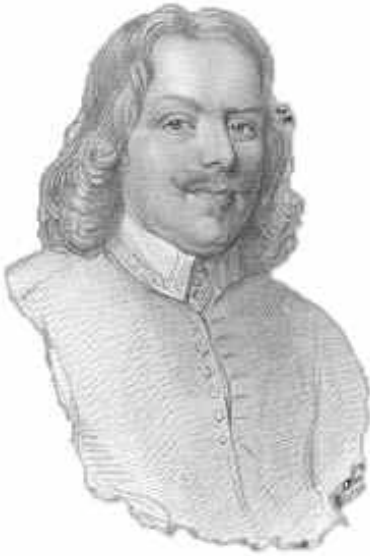
John Bunyan 1628-1688 AD

How God used the faithful sufferings of an ordinary man to birth writings that influenced and encouraged not only his immediate sphere, but the world for hundreds of years to come.